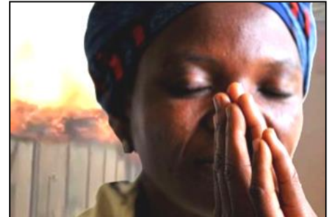
Persecution of Christians is on the rise across Africa.