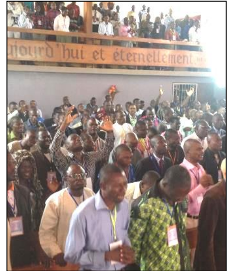
Pastors call on God to pour out His Spirit during the Acts 1:8 Conference