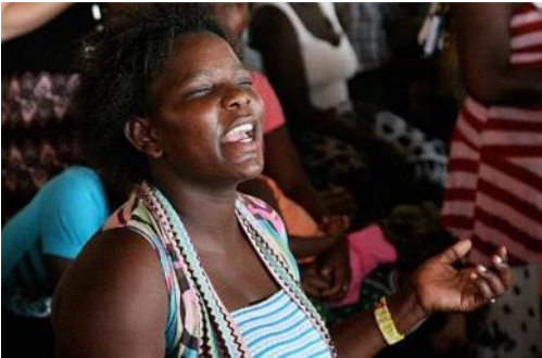
Pray that God will reveal His will to Assemblies of God members across Africa.

Paul prayed for the Christians in Ephesus that “the eyes of their hearts might be flooded with light” (Eph 1:18, NLT).