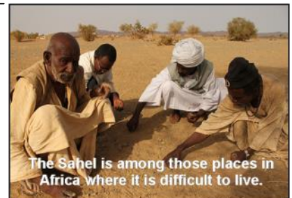
The Sahel is among those places in Africa where it is difficult to live.

The "hard places" are those localities where it is difficult to live and establish churches because of harsh environments or resistant peoples. The hard places of Africa include the dense jungles of Central Africa, the parched deserts of the Sahel, and the teeming slums of the great cities of Africa. Hard places also include those places where people are resistant to the gospel. Sometimes they are even militant in their resistance. However, as a missionary once said, "No door is closed to those willing to lay down their lives for Jesus." This month we will focus our prayers on those hard places. We will call on God to pour out His Spirit on those places. And we will pray to the Lord of the Harvest to send laborers there.— Dr. Denny Miller, AIA Director