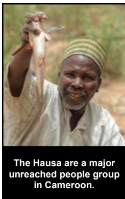
The Hausa are a major unreached people group in Cameroon.

There are 291 people groups living in the Central African country of Cameroon. The Joshua Project lists 16 of those people groups (amounting to more than 3.2 million people) as being unreached. The majority of these people live in northern Cameroon near the Nigerian and Chad borders. One large tribe is the Hausa, with about 343,000 living in Cameroon. They are 99.9% Islamic with only .08% professing Christ as Savior. The Hausa of Cameroon are part of the more than 38 million Hausa people living in Western and Central Africa. Pray for an outpouring of the Spirit among the Hausa. Pray for the Full Gospel Mission of Cameroon as it mobilizes to send missionaries into northern Cameroon. The Full Gospel Mission of Cameroon is an Africa AG Alliance affiliated church.