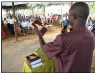
Proclaiming Pentecost being handed out to pastors in Liberia. distribution in Liberia

The Pentecostal sermon book, Proclaiming Pentecost , is being distributed throughout the Africa Assemblies of God.