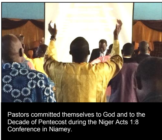
Pastors committed themselves to God and to the Decade of Pentecost during the Niger Acts 1:8 Conference in Niamey.

In the midst of rioting, the brave pastors of the Niger Assemblies of God made bold commitments to the Decade of Pentecost.