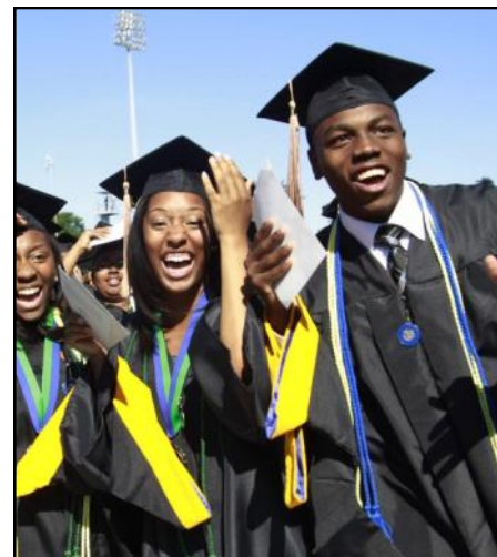
About 6.3 million students are studying in the colleges and universities of Africa.