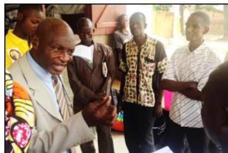
Assemblies of God leaders in Bangui discuss the future of the church at the Guinea Acts 1:8 Conference held in March of 2016

Across the continent, Assemblies of God churches are growing. According to the end of 2017 report, the moment now boasts 23 million adherents meeting in 83,000 churches across the continent. This represents a gain of about a half million new adherents and 18,000 new churches in just one year. Such growth inevitably results in change. And change, if not managed well, can result in conflict. This month, we will ask God to give the leadership of the Africa Assemblies of God the wisdom and godly insight they will need to effectively manage this change and to continue to move their churches forward in the power of the Holy Spirit. — Dr. Denzil R. Miller, Director, Acts in Africa Initiative