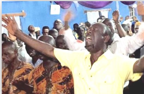
The Sierra Leone Acts 1:8 Conference in Bo was marked by repeated outpourings of the Spirit followed by times of intense prayer.

The West African country of Sierra Leone is still reeling from the devastating effects on the recent Ebola crisis which took the lives nearly 4,000 Sierra Leoneans. Among those who died were Assemblies of God members and pastors. The outbreak officially ended in March.